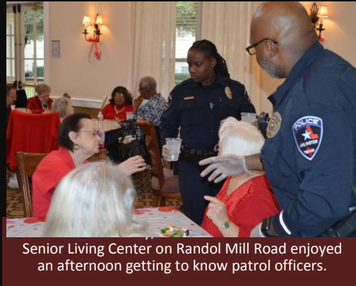
Senior Living Center on Randol Mill Road enjoyed an afternoon getting to know patrol officers.