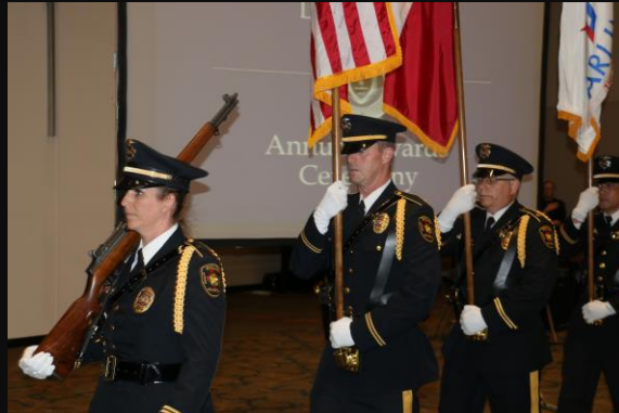
APD Honor Guard presents colors at Awards Ceremony.