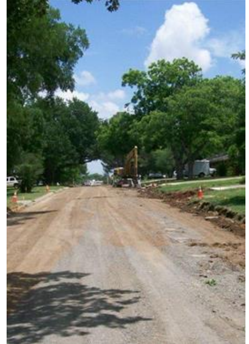
Street Reclamation on Oram Street between Center and Collins