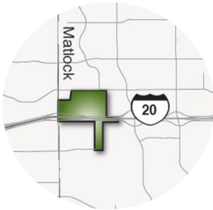
Tax Increment Reinvestment Zone No. 4 Arlington Highlands